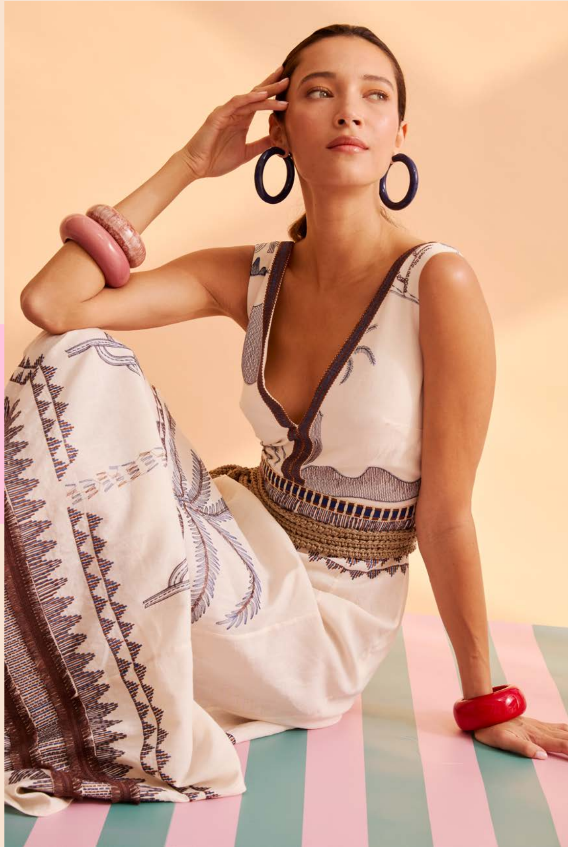
LOOK 20 View product info