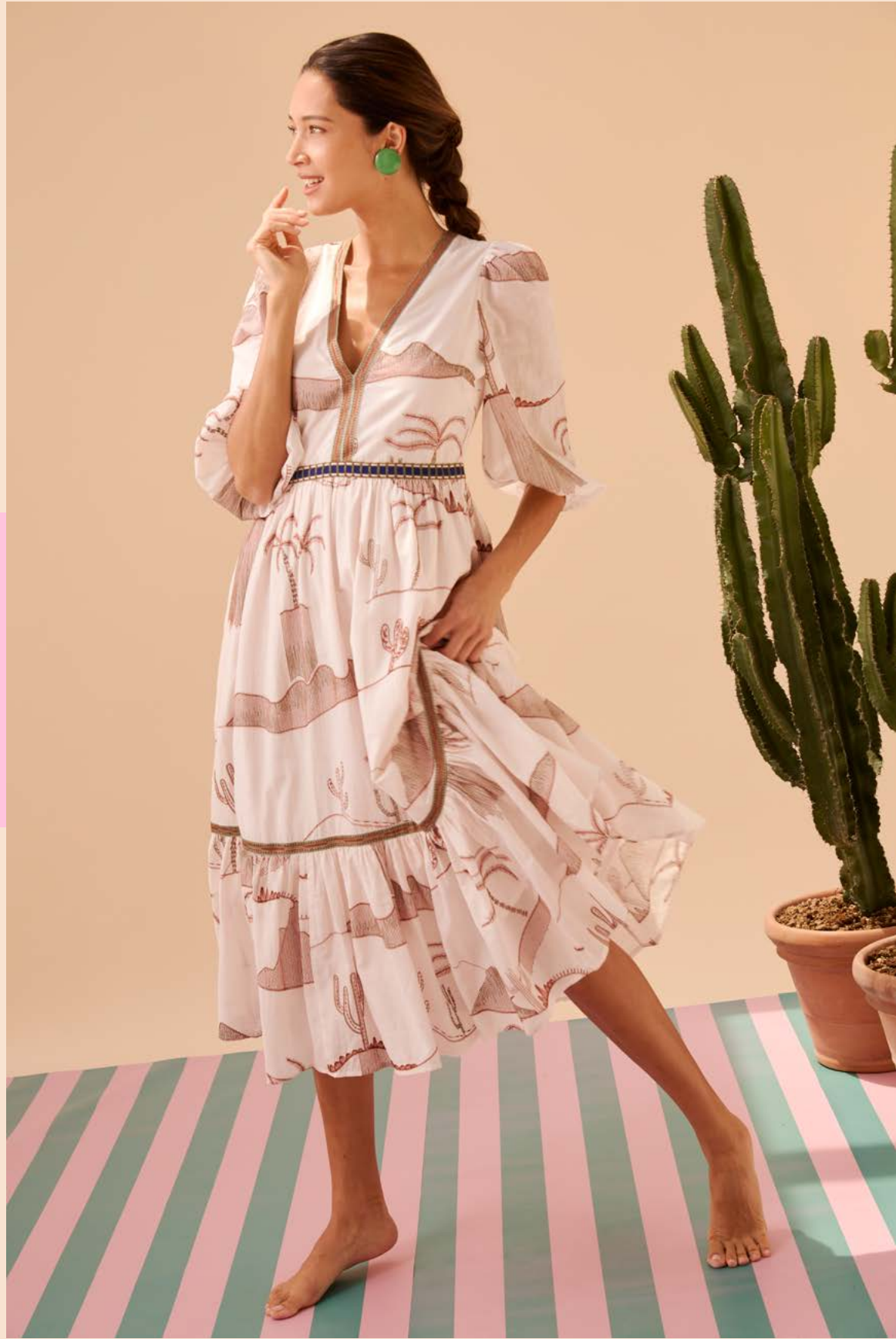
LOOK 03 View product info